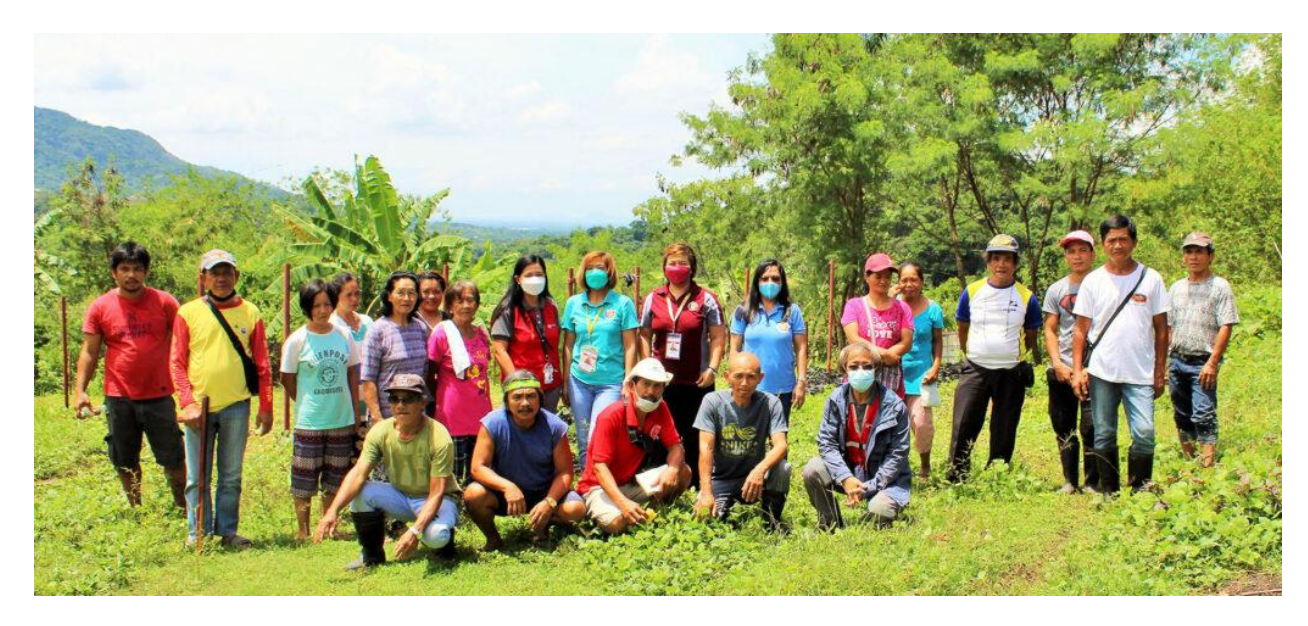
NCC together with NCIP Community Service Center of Sison and tribal elders and leaders of Bangol Canit Samahang Tribu sa Kaunlaran.

Involvement of the community in environmental programs is one of the company's innovative activities. This year, the company partnered with Bangol Canit Ibaloi Samahang Tribu Sa Kaunlaran, a Community Based Forest Management Association. They are from Brgy Inmalog, Sison, one of NCC's neighboring communities. Partnership was sealed with Memorandum of Agreement. Part of the partnership agreement is NCC helps them establish their own nursery, equip them with needed tool and paraphernalia and in return the association sells seedlings to NCC for the company's greening and reforestation programs. The forged partnership will last until the year 2026 where NCC will purchase 35,000 seedlings and the association and its members will receive approximately Php 1,350,000.00 as income.