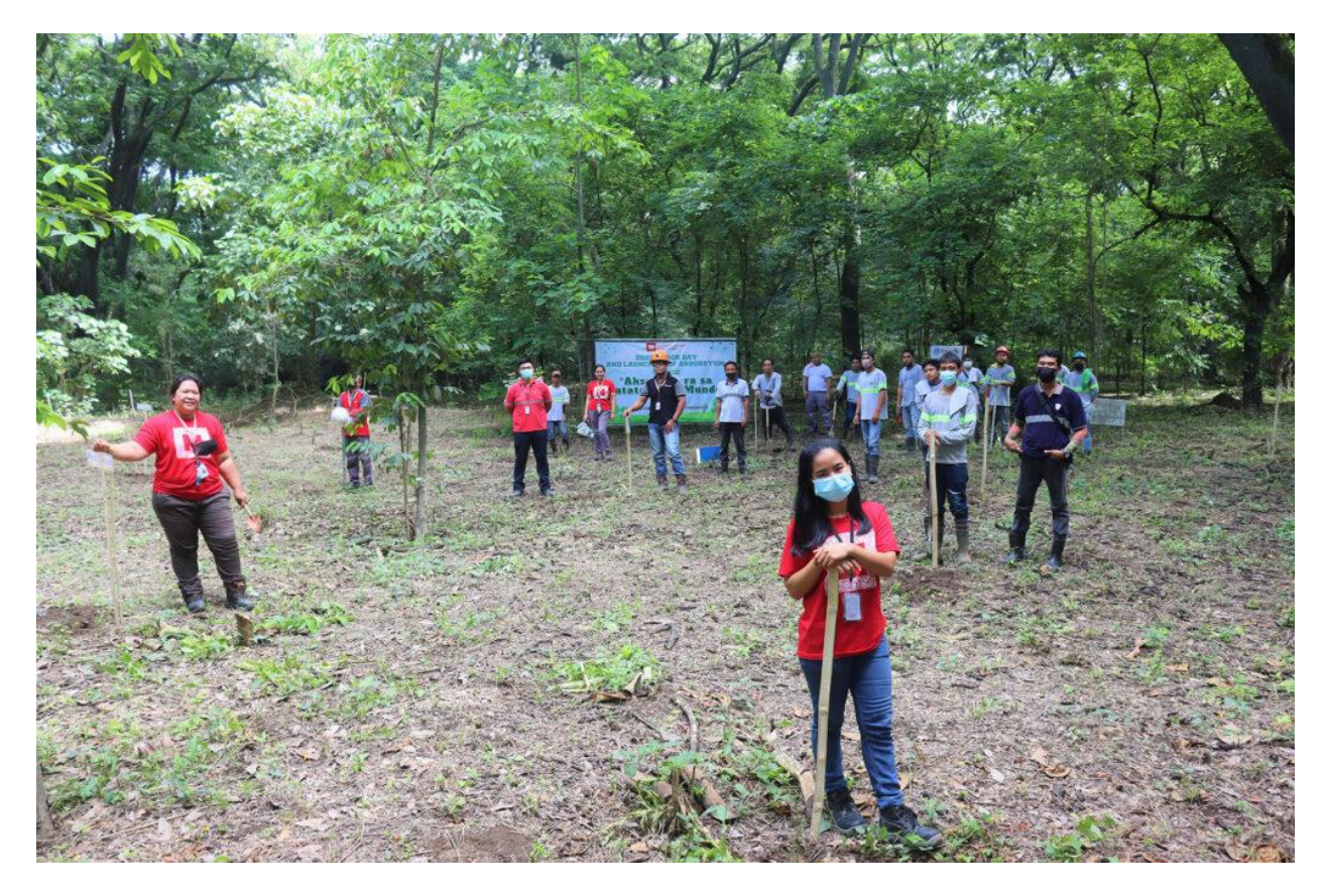
NCC's 2-hectare Arboretum. It is a biodiversity conservation strategy where various endemic fruit-bearing and timber trees are planted. Seedlings harvested from this facility will be used for progressive rehabilitation.

NCC also joined the entire country's celebration of Arbor Day on June 25, 2022. We conducted tree planting program and officially launched our conservation initiative by establishing an Arboretum. This is located in Sapid Mini Forest and is estimated at 2 hectares with various endemic and fruit bearing trees such as Palosapis, Lauan, Narra, Cacao, Balimbing, Guyabano and Makopa.